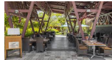
DAFNE A'LA CARTE RESTAURANT

Gözleme Varieties, Çi Börek, Fruit and Ice Cream