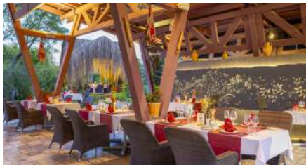
DAFNE A'LA CARTE RESTAURANT