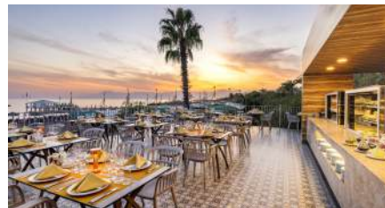
BBQ A'LA CARTE RESTAURANT