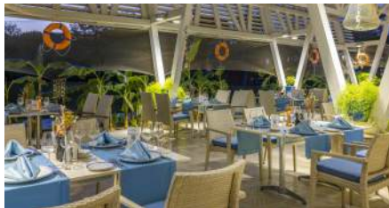
POSEIDON A'LA CARTE RESTAURANT