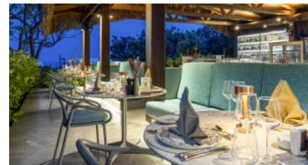
NEYZEN CAFE & RESTAURANT