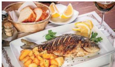
POSEIDON A'LA CARTE RESTAURANT