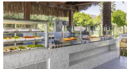
NEYZEN CAFE & RESTAURANT

Gözleme Varieties, Çi Börek, Fruit and Ice Cream